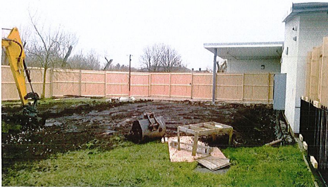
Reduced level excavations for new extension classroom Timber Hoardings (in distance) for site safety and security