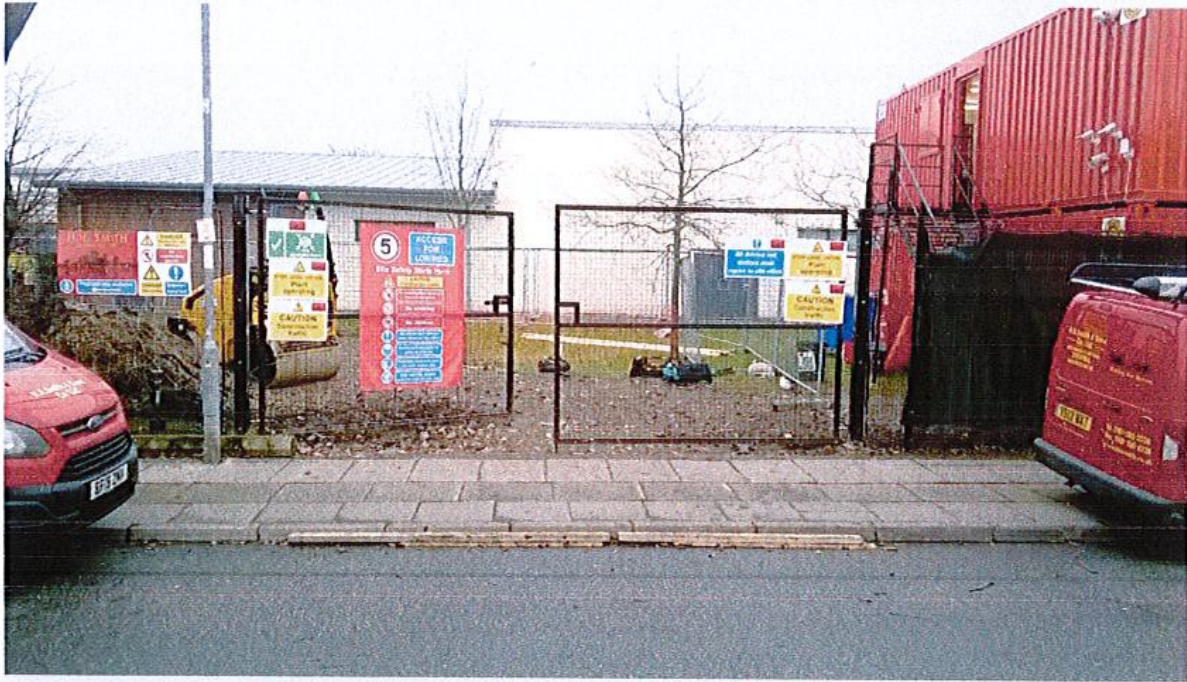
Site Access Gates and Health & Safety Signage