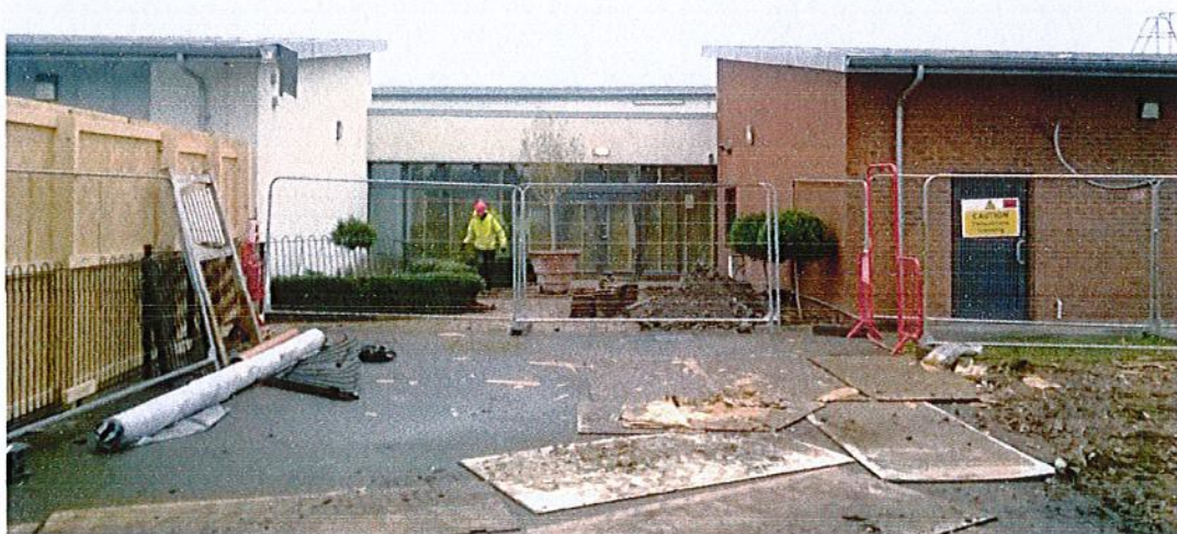
Carefully removing existing equipment from courtyard area.