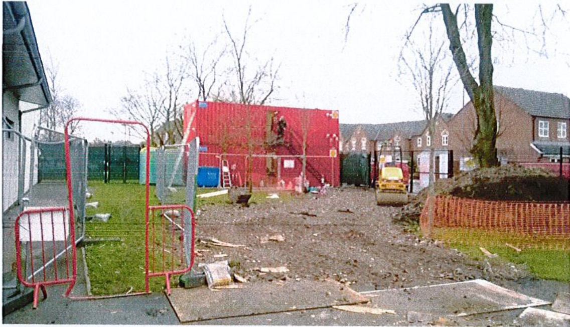
HH Smith Site Accommodation