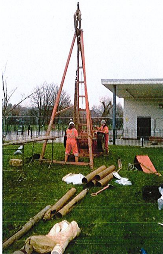
Ground Investigation borehole rig