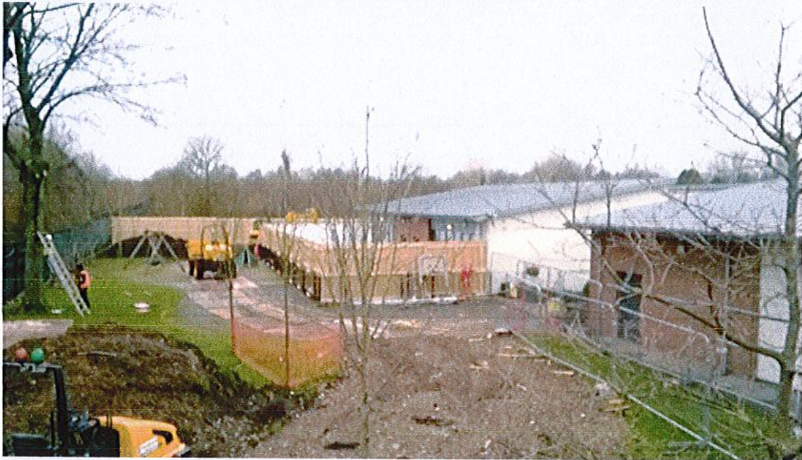
View across construction site from Site Accommodation